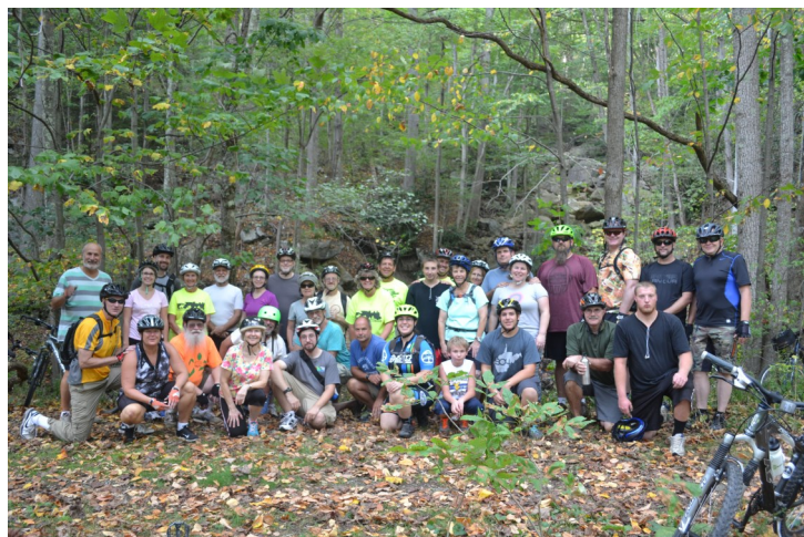
The Blackwater Canyon Bike Ride is a pedaling optional downhill excursion through 13 miles of breath-taking scenery.

Volunteers are needed for the half marathon event!